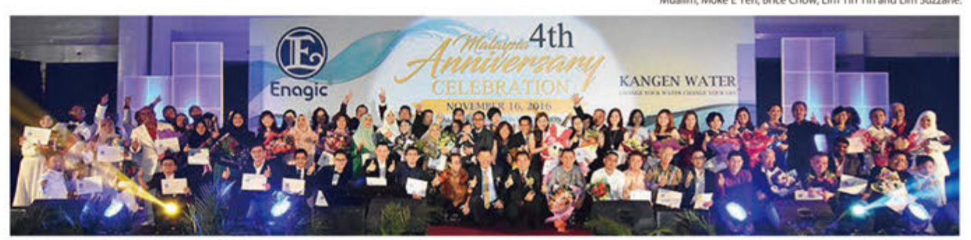
v 6A-2 distributors proudly line up on stage.