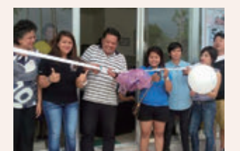
The opening ceremony for Kangen Oasis