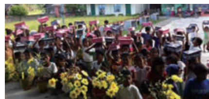
Happy children holding up their gifts