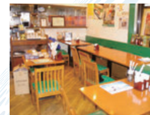
With a capacity of about 30 people, the restaurant is also gaining popularity with Japanese customers. 30人は坐れる店内。日本人客も増えている

すべての料理に還元水を使っているが、とくに玉ねぎと各種スパイスを炒めペースト状にしてから還元水を入れてつくるカレーのルーは大変なめらかに仕上がるという。ほかにもチェイサーはもちろん、ヨーグルトをつくる水やナンの材料の小麦を溶かす水などで還元水が大活躍。チャンドラニさんは「何より健康第一です!」と強調している。