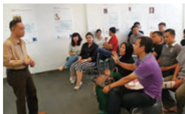
Seminars are held regularly セミナーも連日のように開催