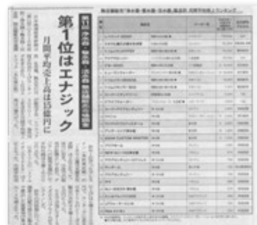
Enagic Branch News

The specialized journal of the distribution industry, Nihon Ryutsu Sangyo Shimbun, (combined issue of April 28 & May 4) has announced the average monthly sales figures of 2016 in the category of "generators of purified and electrolyzed water." Enagic's Leveluk SD501 came out on top with a monthly sales of ¥1.5 billion (including overseas sales), while the second highest was ¥916 million and the third came in at ¥630 million. Enagic's numbers were by far the best in this category, which is the direct result of all of your hard work. We are extremely grateful for your contributions.