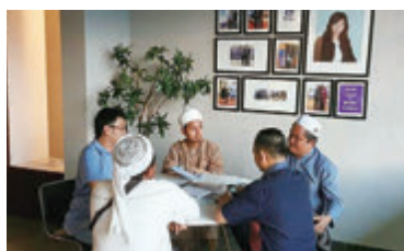
Busy showroom space いつも賑わうサロンスペース