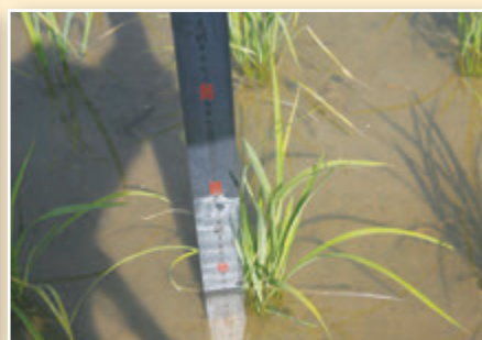
Rice plants growing steadily in Paddy A. 順調に成育するA田の稲穂