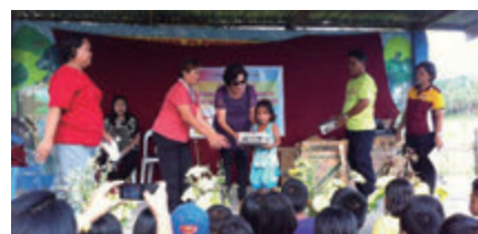
The children were each given their shoes at the ceremony