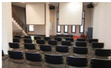
Seminar room equipped with a projector 映像機器も使えるセミナールーム