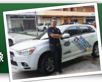
The team's Kangen Shop in Kota Kinabalu コタキナバルにあるチームの還元ショップ