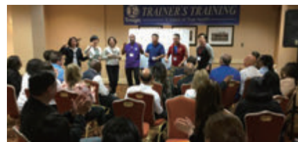
This is also a part of the training session.