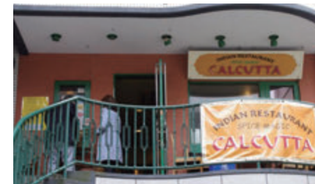
The exterior of the Subway Tozai Line・Nishi-Kasai Minamiguchi (south entrance) branch. The main branch is located near the north entrance of the station. 地下鉄東西線・西葛西駅南口店の全景。本店は北口にある

Address: 201-5-24-6 Nishikasai, Edogawa-ku, Tokyo 134-0088 Phone: 03-3688-4817