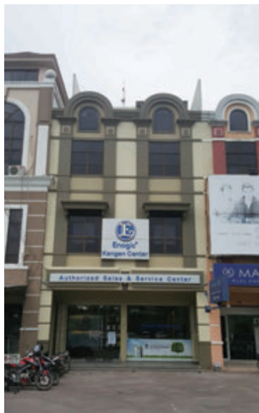
Office building bearing a massive Enagic logo 巨大なエナジックのロゴマークを掲げたオフィスビル