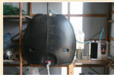
Super 501 installed in the workshop next to the water storage tank. 貯水タンクを付設した作業所内のスーパー501

Conducted by Ido Agriculture, transplantation of the “Electrolyzed Water Farming” in Kanagawa Prefecture was in full swing in the month of May. In rice farming, one of the most important processes is the rice seed disinfection. For the cleaning and disinfecting of the rice seeds, the Leveluk SD Super 501 was kicked into top gear as it generated acidic electrolyzed water, a “Designated Harmless Agricultural Chemical” approved by the Ministry of Agriculture, Forestry and Fisheries and Ministry of the Environment for its sterilizing power and its harmless effects on the human body and the environment.