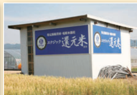
A large sign put up on the work shed to appeal to neighboring farmers. 作業小屋に取り付けた看板で近隣の農家にアピール