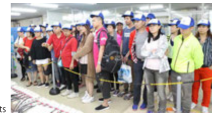
Intensely observing the last assembly line of the Leveluk units