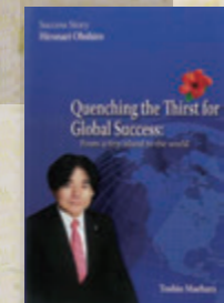
"Quenching Thirst for Global Success"